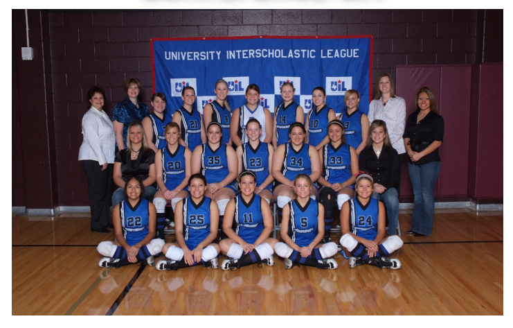
Windthorst High School